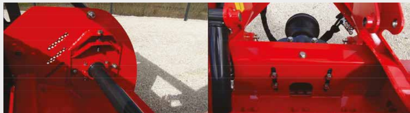
Adjustment of the belt tension by moving the gearbox and its extension