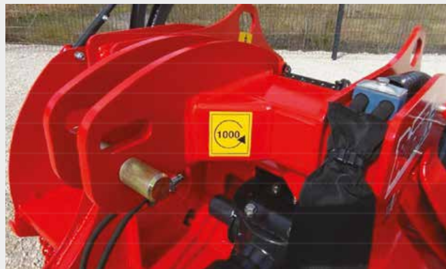
1000 rpm (optional 540 rpm)

ROTORS DESIGNED AND TESTED WITH AND FOR YOU SECURE LOCATING AND LOCKING OF THE HAMMERS EASY AND QUICK CHANGE OF THE WEARING PARTS